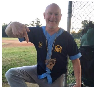
Renegade of the week – Doc!

PS – The umpire (Cornel) was top quality, probably one of the best I can recall.